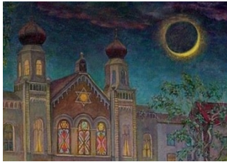
"Blessing the New Moon II" - Victor Brindatch (1941 - )

WEEK OF OCTOBER 24 - 30, 2014 30 TISHREI - 6 CHESHVAN, 5775